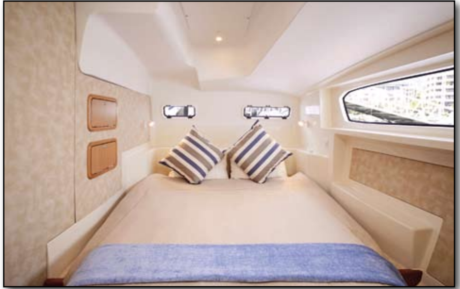
The guest bathroom, and right, the guest cabin which is large, well appointed, well lit with natural light and airy.

40 feet long. Catamarans are generally quite similar in layout as the basic design is nearly identical, and it's normally the level of finish and hardware that set them apart from each other. Mostly, they are designed for cruising and the emphasis is placed on creature comforts while passage making. Simply put, they are wonderful, moveable apartments that allow you to have the comforts of home while anchored in some of the best places on the planet. This is not the case with the Maverick