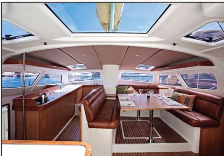
The saloon dining area with good all-round views and plenty of light from the side windows and hatches above.

option with four double cabins and shared heads on either side.